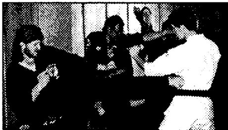
(IKKA Camp Cont.)

Freestyle." She says, "You have to learn to take a punch and give a beating," and if you've ever seen her fight, like last year at the IKC, you KNOW SHE CAN. Her seminar was a cornucopia of drills designed to deceive your opponent, read him, jam him, and much more. She is a down to earth, clearspoken individual who gives a great class.